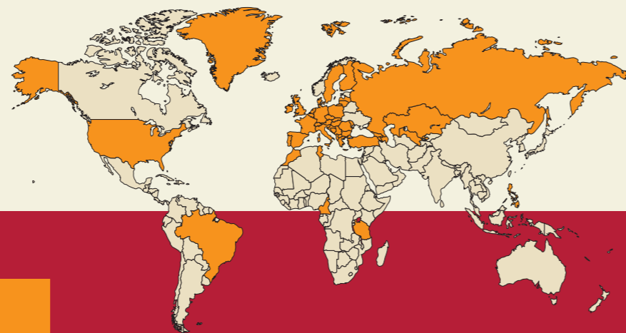
Nationality of EOA Participants since 2003

The deadline for application is 5 September.